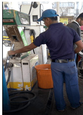
Figure 3. Repeated activities that require load handling