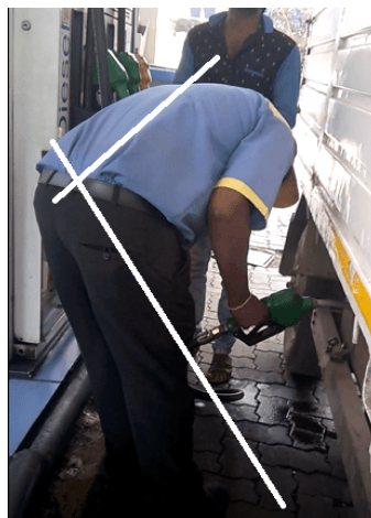
Figure 1. Risk posture assessment at work

The rapid entire body assessment (REBA) analysis was applied to assess the different risk postures, such as in Figure 1 (Hignett and McAtamney, 2000; Al Madani and Dababneh, 2016; Syahril and Sonjaya, 2015).