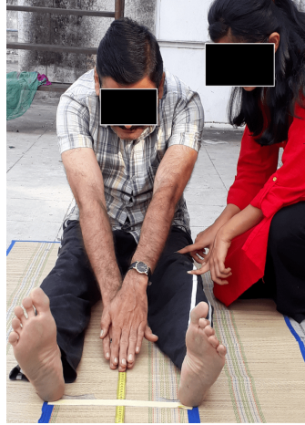
Figure 5. YMCA sit-and-reach test

17.0. Statistical measures such as Mean, Standard Deviation, and Spearman's correlation coefficient were used P \leq 0.05 .