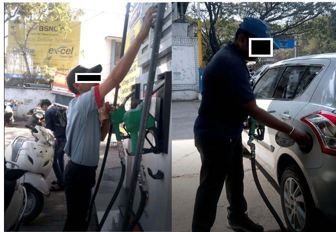
Figure 2. Repeated activities that use force