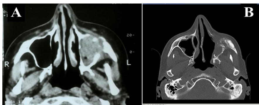
Figure 3A and 3B. Sinonasal cancer in a worker exposed to chromium and nickel compounds

Figure 3A and Figure 3B show a sinonasal cancer in a worker exposed to chromium and nickel compounds. Figure 3A reproduces the initial computed tomography scan showing a lesion occupying the left maxillary sinus, which has destroyed the bone structure of the left maxilla and invaded the soft facial tissue and the pterygopalatine fossa. Figure 3B reproduces the computed tomography scan 12 years later, after surgery and radiotherapy, showing changes in the nasal fossa and left maxillary sinus, with a fibrotic mass of scar tissue.