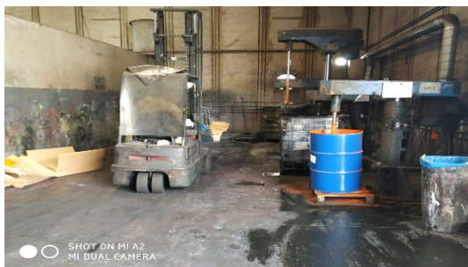
Figure 4. Mixing room where pigments for industrial use are manufactured

To describe the case of a worker exposed to lead chromate who presented high chromium concentrations in urine, a study was conducted of the environmental chromium concentration in the workplace. This entailed a visit to the workplace to determine the characteristics of the reactors where the different pigments were obtained, including lead chromate (Figure 4).