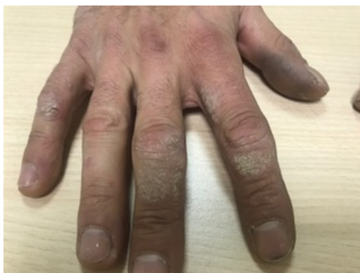
Figure 1. Hexavalent chromium allergic dermatitis

Acute poisoning from ingestion of hexavalent chromium compounds can cause digestive disturbances (vomiting, diarrhoea, abdominal pain, intestinal bleeding) and acute kidney failure (Sanz et al., 1991; Barceloux, 1999). Fatal cases due to circulatory collapse have been described (Loubières et al., 1999). In addition, hexavalent chromium compounds are sensitizers of skin (Figure 1) and lung (Barceloux, 1999; Handley and Burrows, 1994).